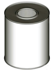
CONICAL DRUM, WITH PLACE FOR PLASTIC INSERT